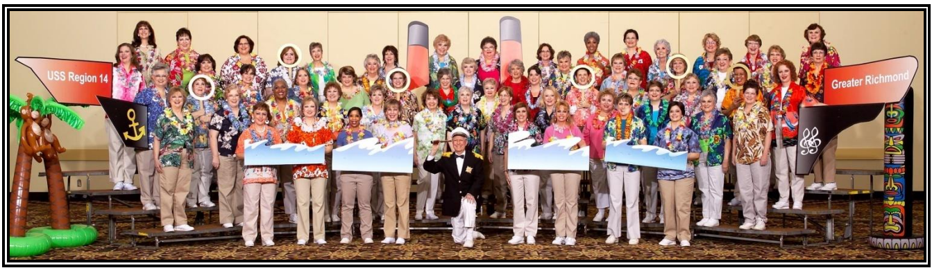
“Hawaiian Holiday – 2008”